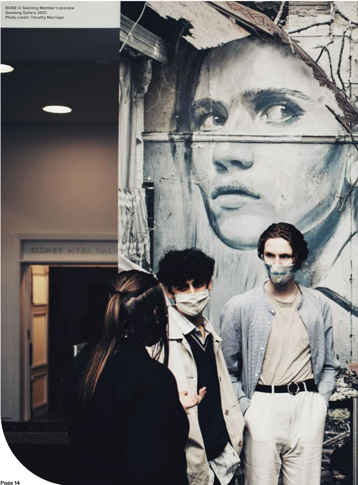
RONE in Geelong Member's preview Geelong Gallery 2021.