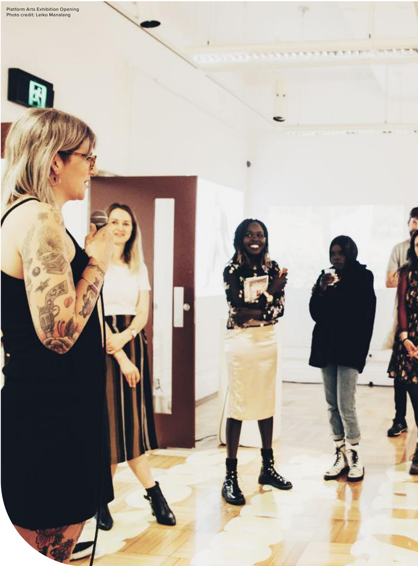
Platform Arts Exhibition Opening