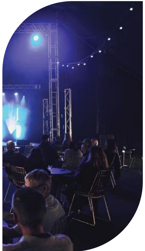
Above and front cover: Geelong Arts Centre Summer Session under the big top